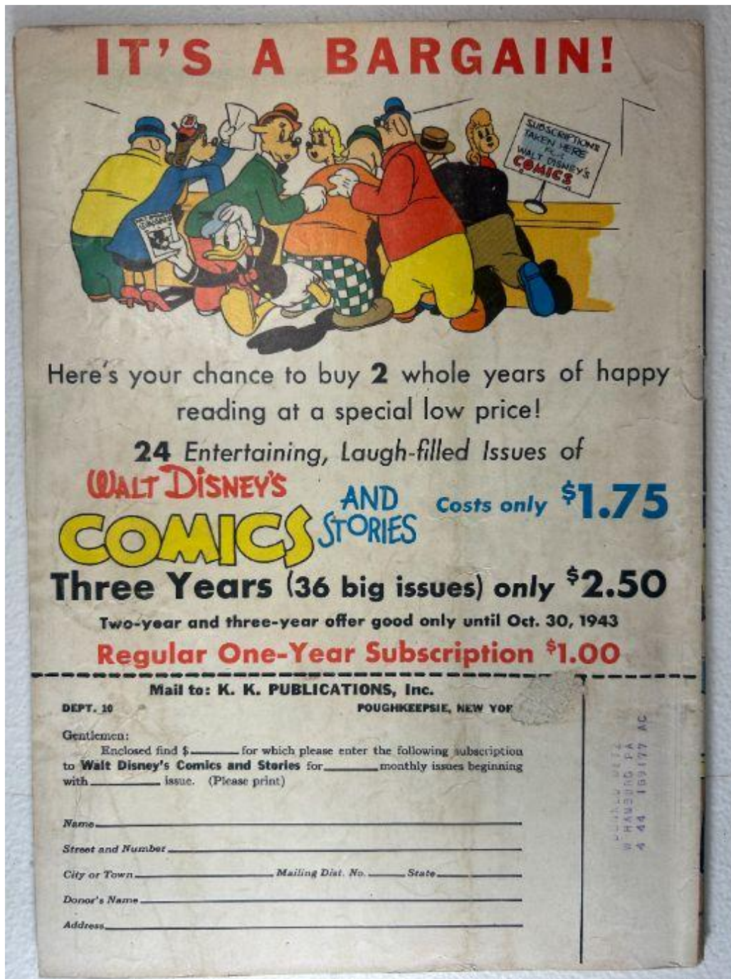
Image is clear and evenly lit, fully framed with edges and corners visible.