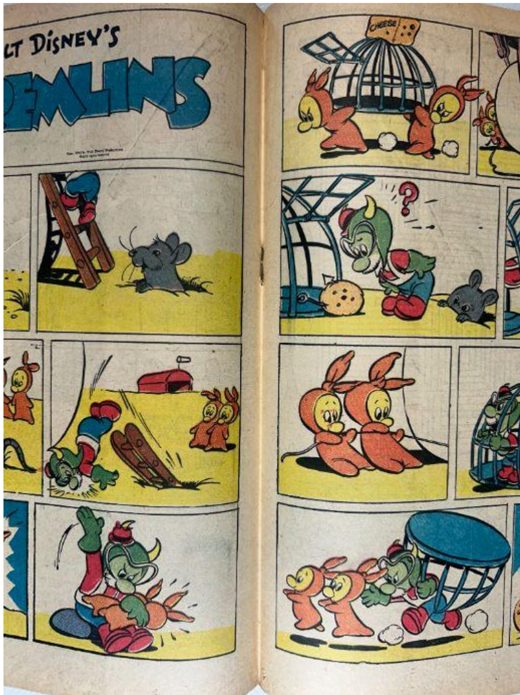
Image is in focus and evenly lit, clearly showing both pages and the gutter.