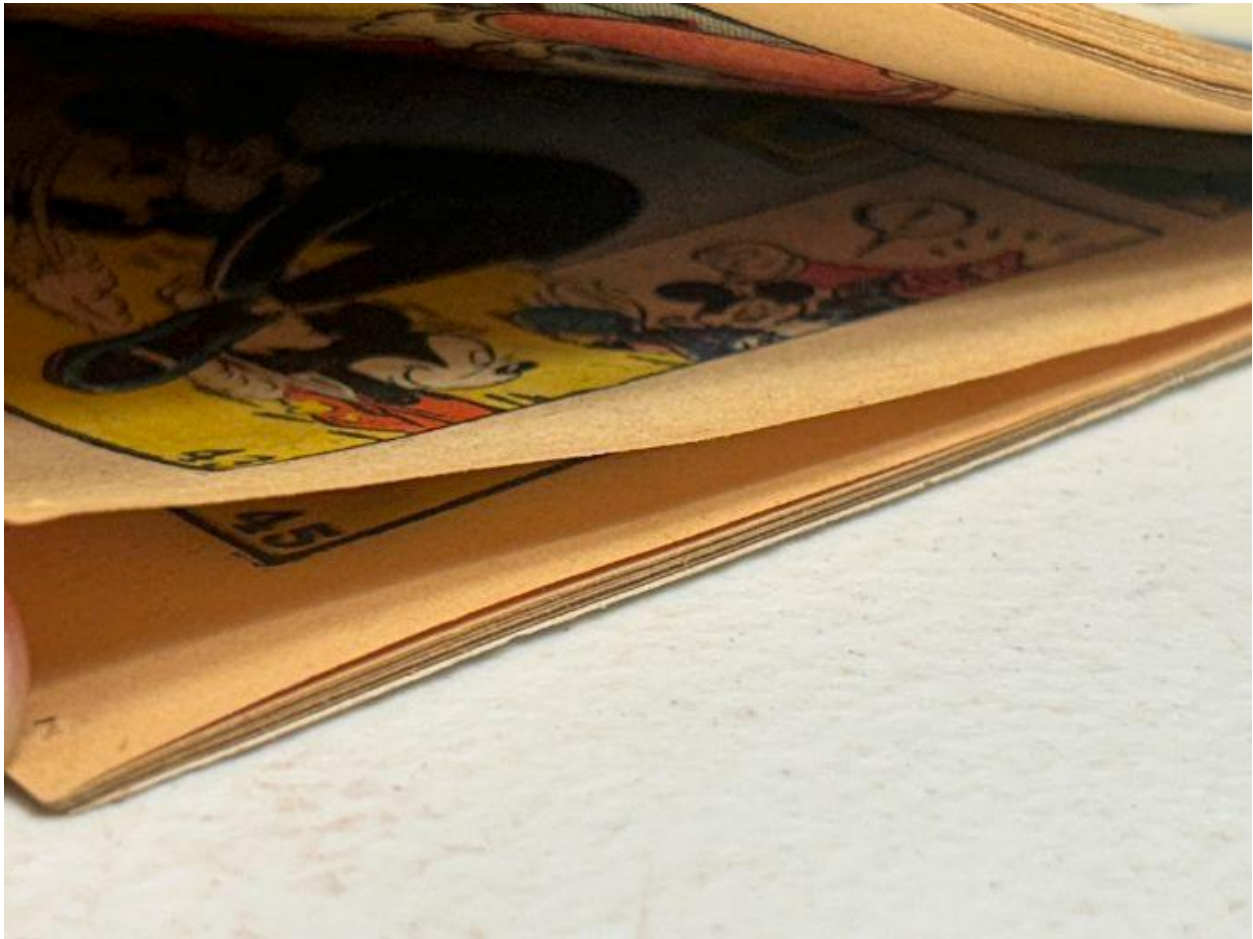
Image shows a single interior page lifted above flat underlying pages.